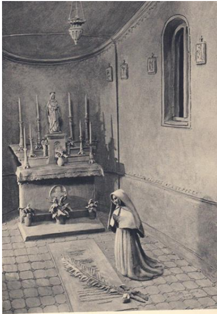
Dans le jardin de la Maison-Mère, se trouve un modeste oratoire, qui pendant 25 ans, a gardé les précieux restes de la Bienheureuse Emilie de Vialar déposés maintenant sous le maître-autel de la grande chapelle.