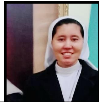
Sister Naw Emerita Province: Myanmar