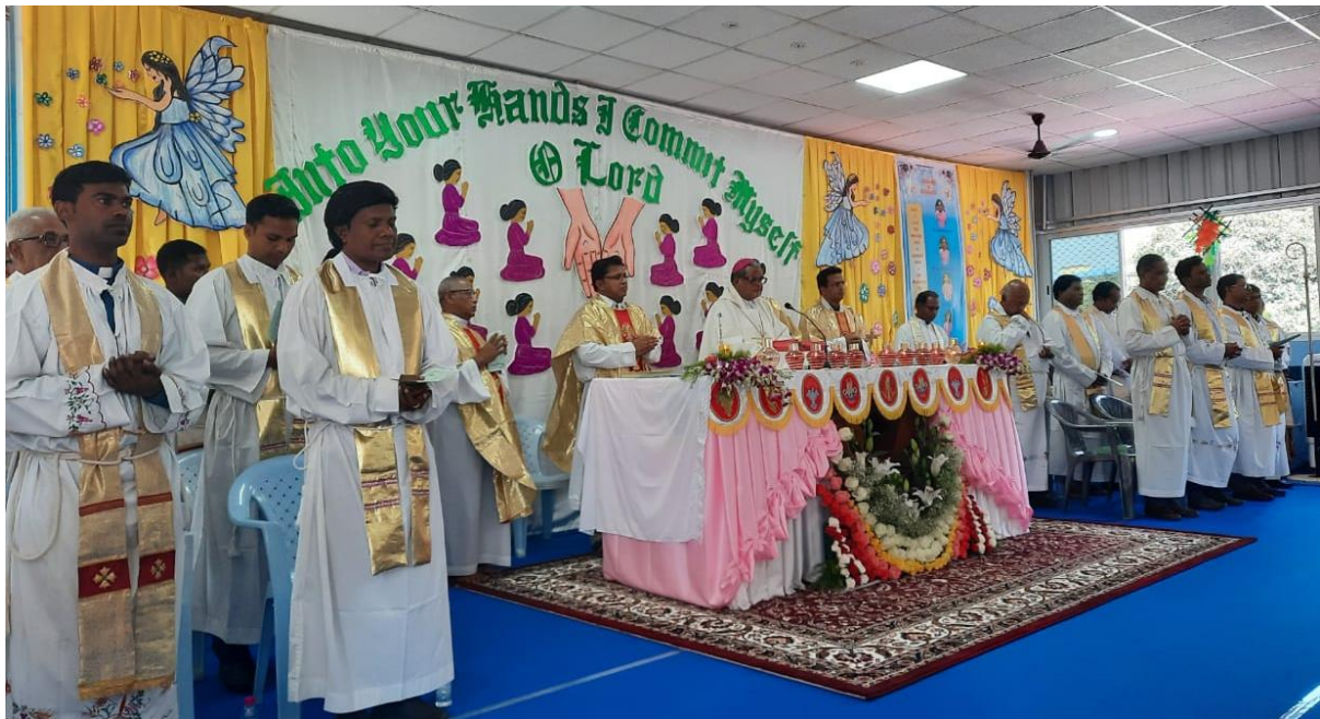
The Celebrant exhorted the Professed Sisters to share the missionary task of the Master not just like servants but like friends of Christ enjoying inner freedom and deeper bond of oneness.